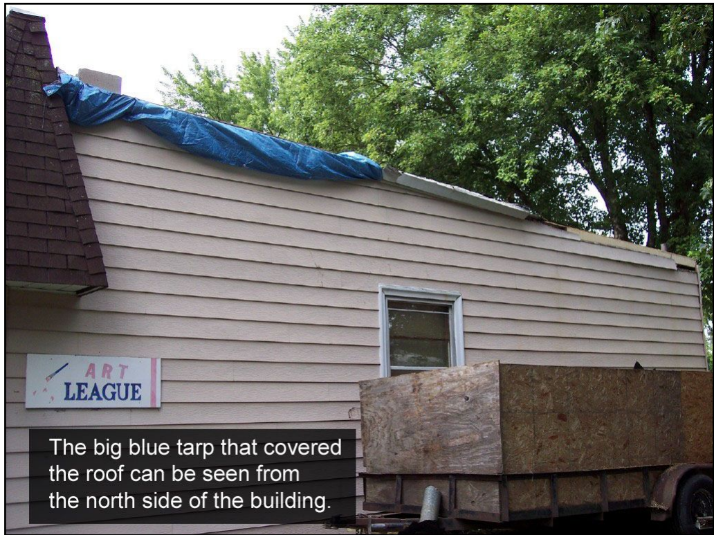
The big blue tarp that covered the roof can be seen from the north side of the building.