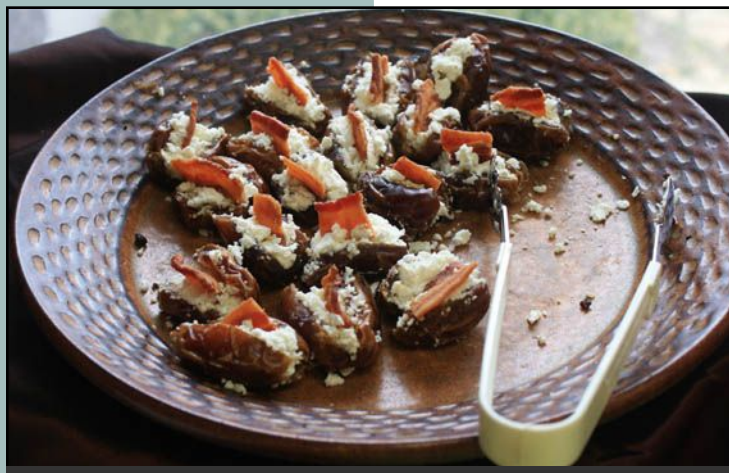
Refreshments served at the reception included Trudy Wyatt's dates stuffed with goat cheese and topped with a crispy square of bacon.