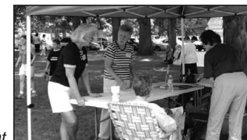
Members at our information tent