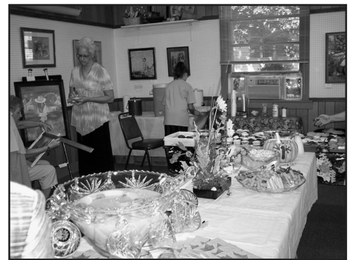
The studio was full of food and art for the 70th celebration.

A very special thank you all the members who helped clean on clean-up day, those who made cupcakes and everyone who was there to help on the Anniversary Party day.